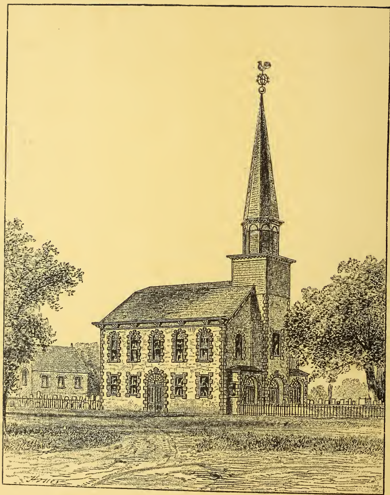
THE FIRST REFORMED DUTCH CHURCH.—FISHKILL VILLAGE.